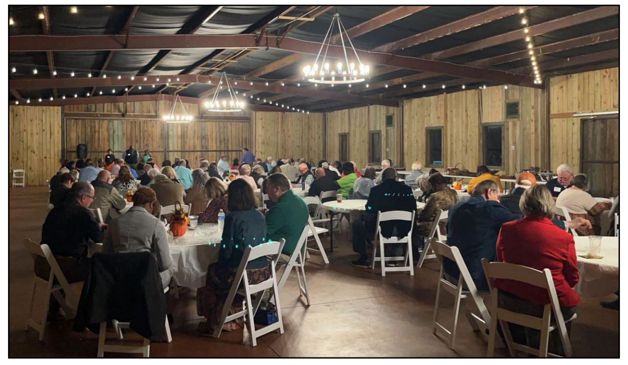
The 2022 SGRC Area Officials Appreciation Dinner at The Farm in Adel