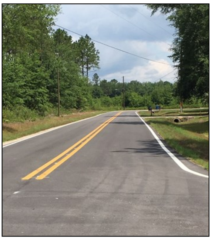
Street, Flood, and Drainage Improvements

SGRC Community and Economic Development Division Reminds City and County Governments of CDBG Planning Time (cont.)