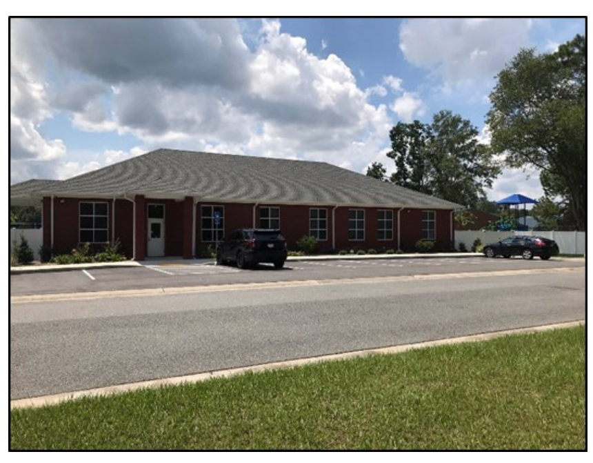
Public Facility Improvements