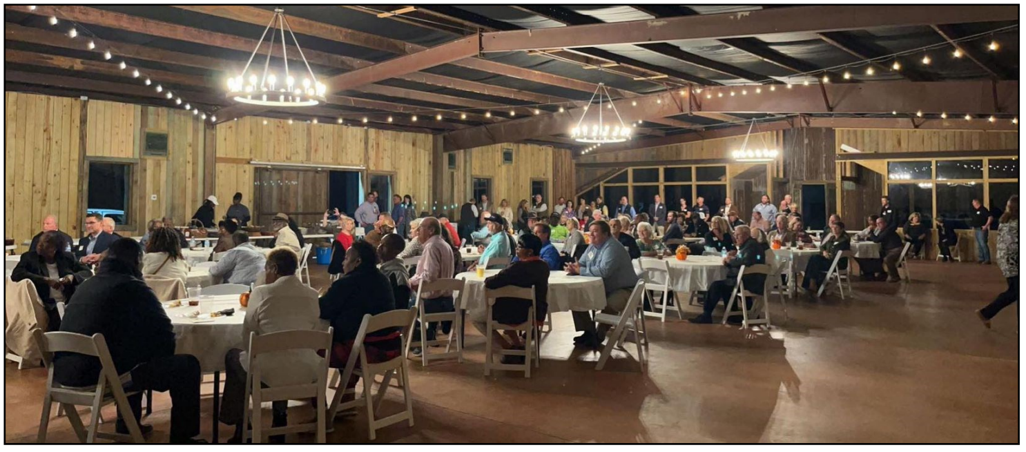
The 2022 SGRC Area Officials Appreciation Dinner at The Farm in Adel

On November 9, the SGRC hosted the very well-attended 2022 Area Officials Appreciation Dinner at The Farm in Adel. Attendees enjoyed good food in a relaxed atmosphere during the annual evening of fellowship. The SGRC is grateful for its partnerships with community leaders and looks forward to future collaboration and cooperative work to benefit the region.